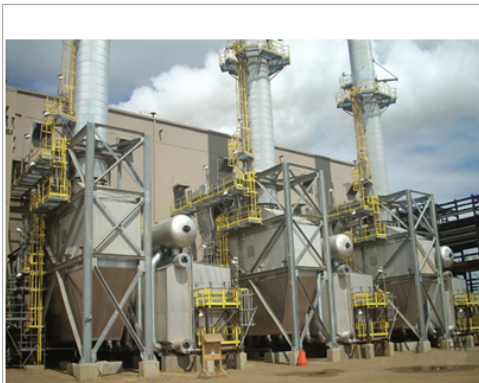
4. New packaged boiler design. Cleaver-Brooks has designed a high-efficiency, low-NO x elevated drum package boiler that generates 426,000 lb/h of steam at 550 psig and that minimizes field erection time.

Five natural gas-fired, shop-assembled integrated boilers capable of generating 426,000 lb/h of saturated steam at 550 psig were recently commissioned in Canada (Figure 4). These package boilers were different from the typical D-type boilers in two major respects. First, the design used an elevated drum with external downcomers and risers, which helped to increase the furnace and convection bank dimensions while maintaining the ability to ship the units. In addition, a glycol-based closed-loop heat-recovery system consisting of three finned tube heat exchangers was incorporated to improve boiler efficiency by about 2.3% and to increase the air temperature to the forced draft fan in severe winter conditions, when -30F to -40F is likely to be the ambient temperature.