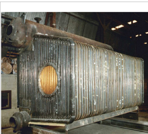
6. More efficient wall design. The water-cooled D-type boiler furnace uses a leakproof membrane wall. The arrangement is shown without insulation during shop assembly.

A dual low-NO x burner with flue gas recirculation provision along with a completely water-cooled furnace was used to meet Canadian NO x emission standards (Figure 6). Typical burner front wall design in these boilers has some refractory behind the furnace tubes, which reradiates energy back to the flame. That, in turn, increases local combustion temperatures and generates additional NO x . The membrane-walled front wall where the burner is mounted is completely water-cooled and, as a result, cools the flame better. The completely water-cooled furnace design has a higher effective cooling area for a given volume and lowers the heat flux to the steam/water mixture by about 12%.